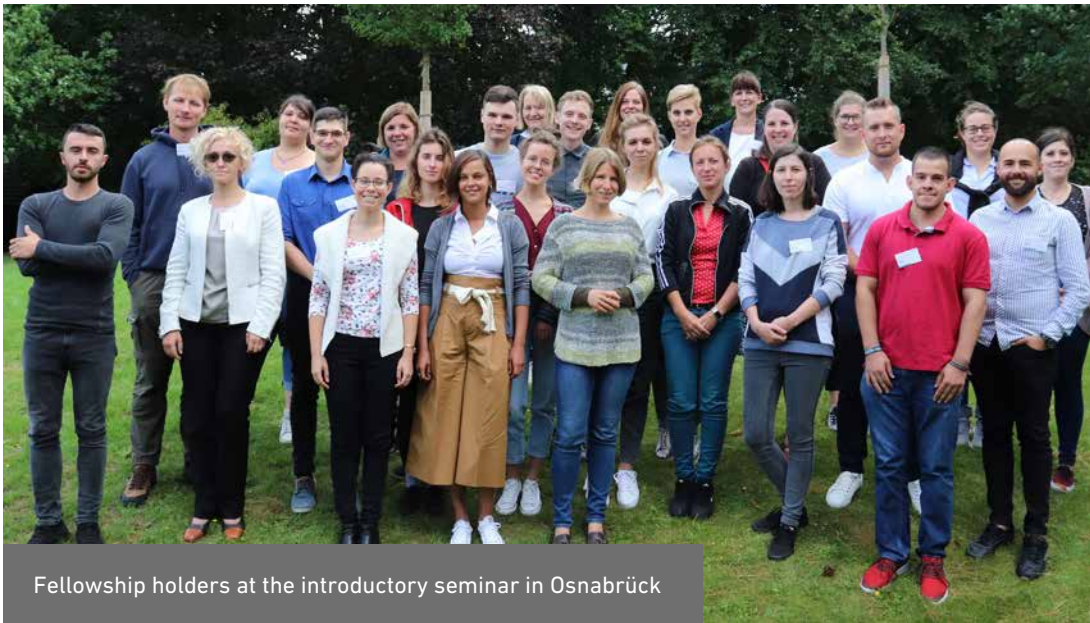
Fellowship holders at the introductory seminar in Osnabrück