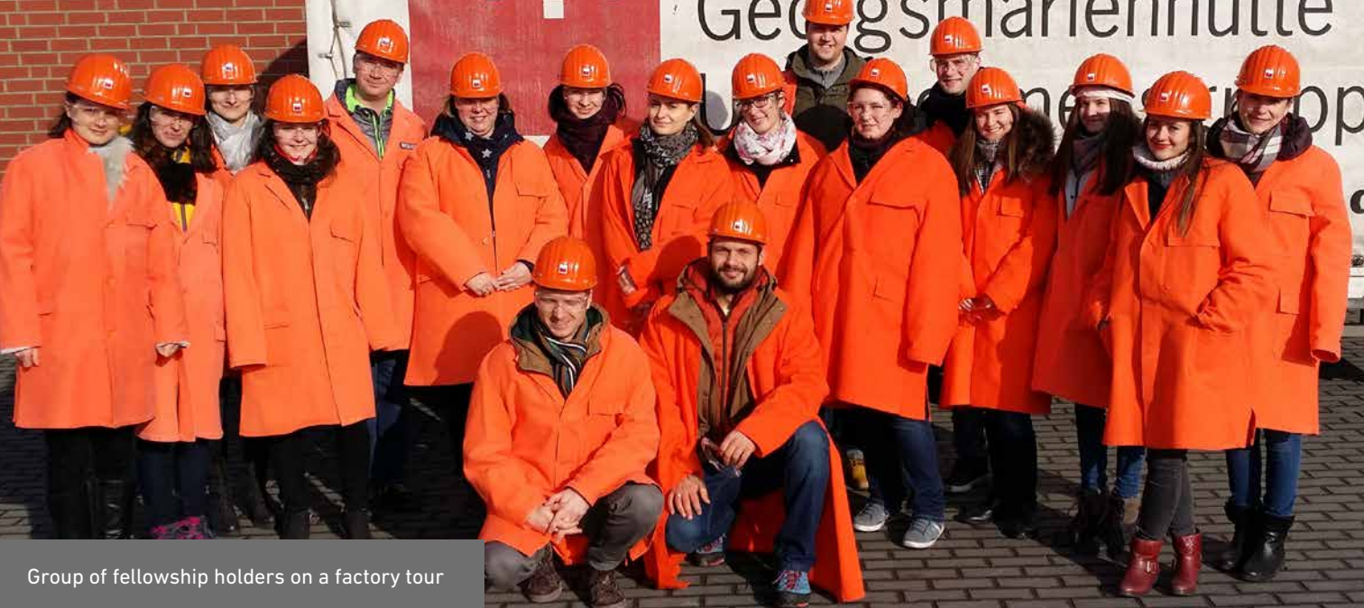
Group of fellowship holders on a factory tour