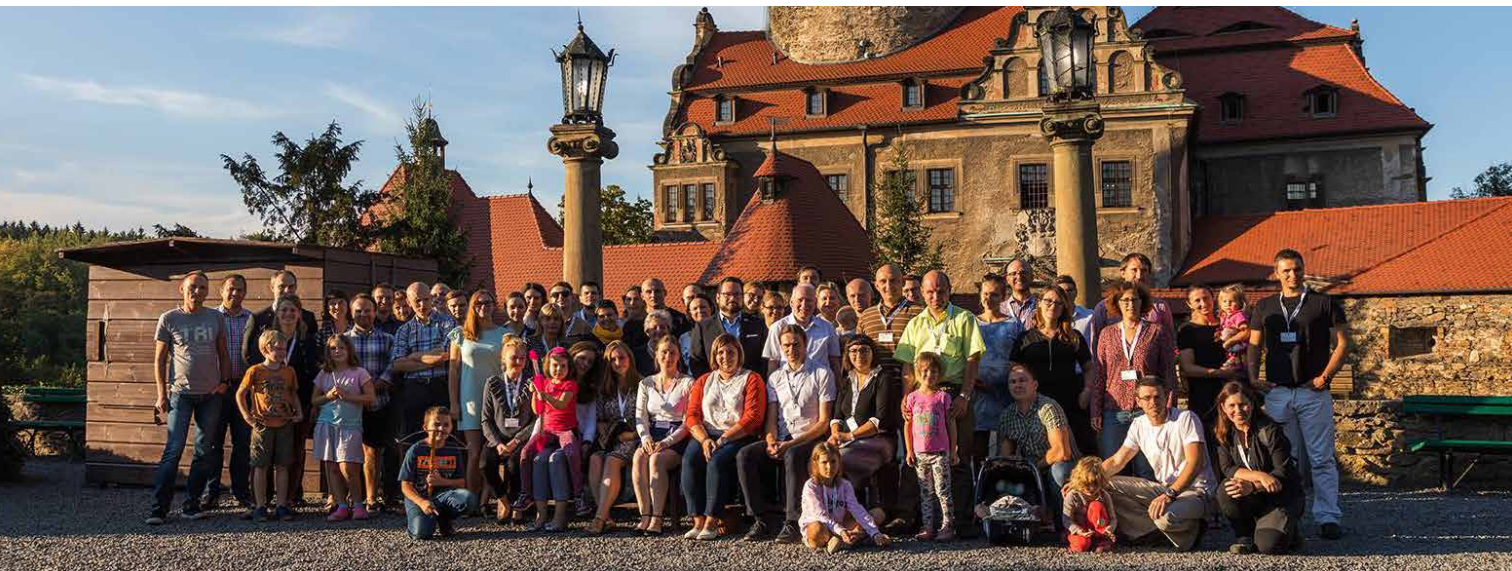
Group of Polish fellowship holders at annual alumni meeting

Germany. The alumni associations organise annual meetings and other meetings (e.g. regulars' tables) in their countries, which also serve to integrate returning fellowship holders into the association. In addition, they organise international professional events and maintain cross-border cooperation. The alumni associations also send representatives to important DBU events in Germany, e.g. the annual presentation of the German Environmental Award, the Week of the Environment at the German Federal President's residence, the annual international alumni workshop for the exchange between the alumni associations.