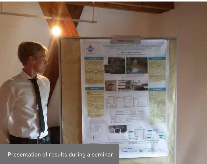
Presentation of results during a seminar

There are two starting dates per year for the fellowships: early in February (for the September application deadline) and in the middle of August (for the March application deadline). The fellowship begins with an introductory seminar for all new fellowship holders in Osnabrück, at which important organisational matters for the stay in Germany are clarified. This is followed by an intensive German language course in Osnabrück lasting several weeks. Accommodation for the fellowship holders during the introductory seminar and the intensive German language course in Osnabrück is organised by the DBU.